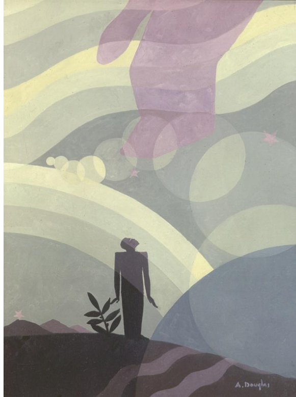
Aaron Douglas, The Creation , 1935, Oil on Masonite, 48 x 36", Howard University Gallery of Art, Washington, D.C.